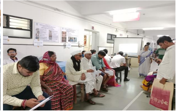
15.03.2023- Registration Feedback forms Filling up, Glaucoma awareness Questionnaire filling up Medicine Distribution and check-up